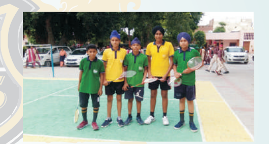
all - round development