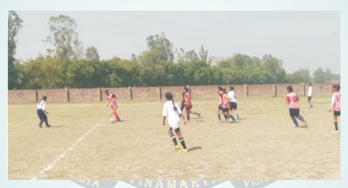
Singhpurian's participating in sports competitions.